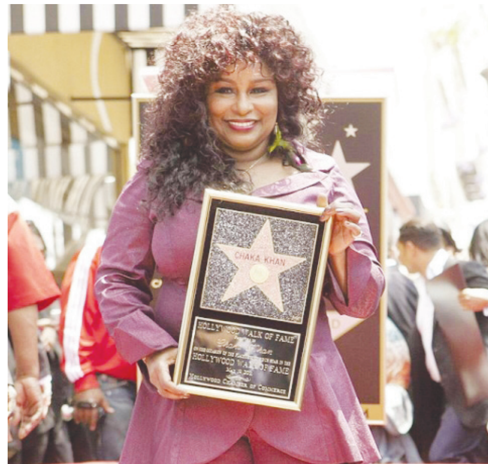
Grammy Award winner Chaka Khan is honored with a star in the Hollywood Walk of Fame.