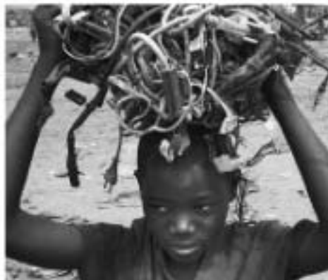
Child carrying e-waste