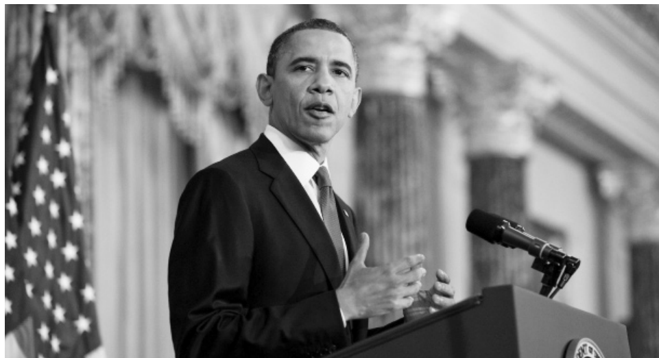
President Barack Obama gives his address on the Middle East at the State Department in Washington D.C.