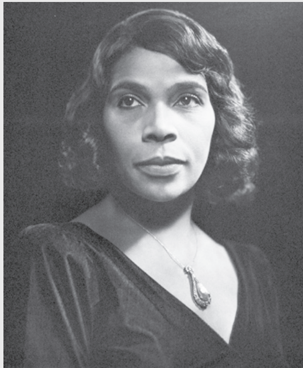
(February 27, 1897 – April 8, 1993)

With the aid of President Franklin D. Roosevelt and First Lady Eleanor Roosevelt, Anderson performed a