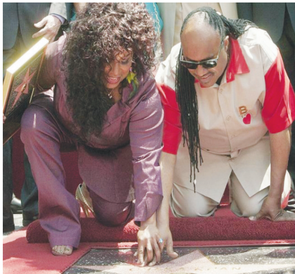
Chaka Khan, left, and Stevie Wonder touch her new star at dedication ceremonies on the Hollywood Walk of Fame

Chaka Khan received her long overdue star on Hollywood's Walk of Fame during a ceremony that included her family and good friend Stevie Wonder.